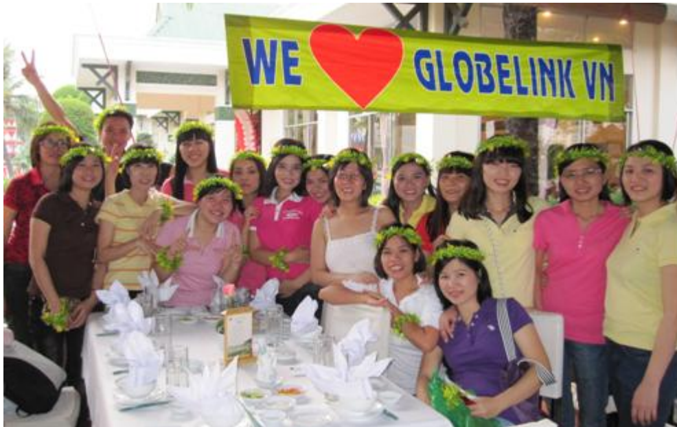
Globelink Vietnam Team