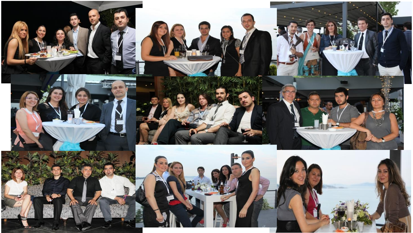
Invited guests at the party

Globelink Unimar is among the market leaders offering a wide range of activities including LCL & FCL ocean freight activities, air freight, road transportation as well as logistics capabilities.