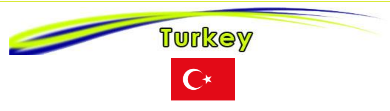
Team Building & Training

Globelink Turkey held their team building and training for all staff members at the Hegsagone Hotel on 20^{th} – 21^{st} April 2013.