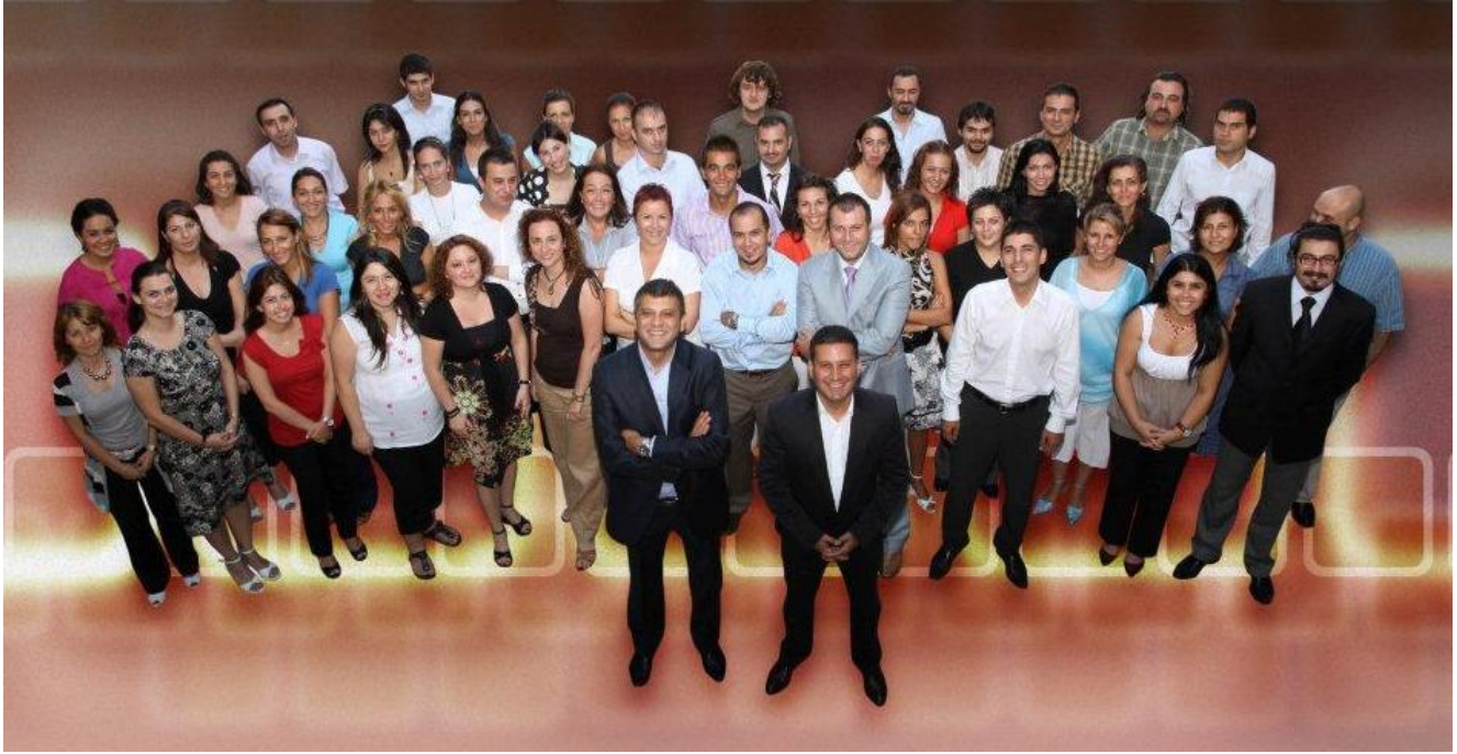
Globelink Unimar Team