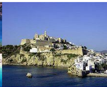
Ibiza Town, Spain