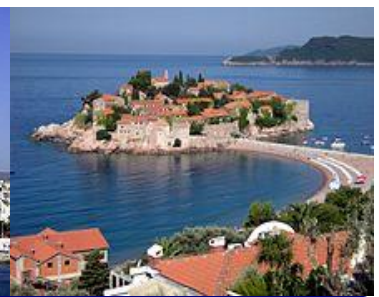
Sveti Stefan, Montenegro